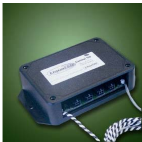
LiquaLED Control 100