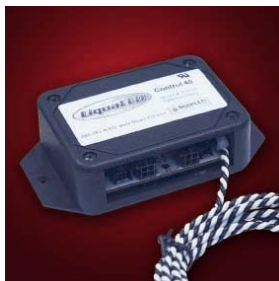
LiquaLED Control 40