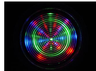
Full Spectrum Color Control